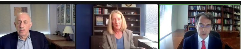
A Former President Indicted: The Special Counsel and the Road Ahead June 14