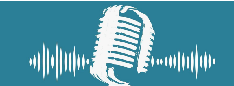
A Year in Russia's War Against Ukraine: Forging a U.S. Response February 24