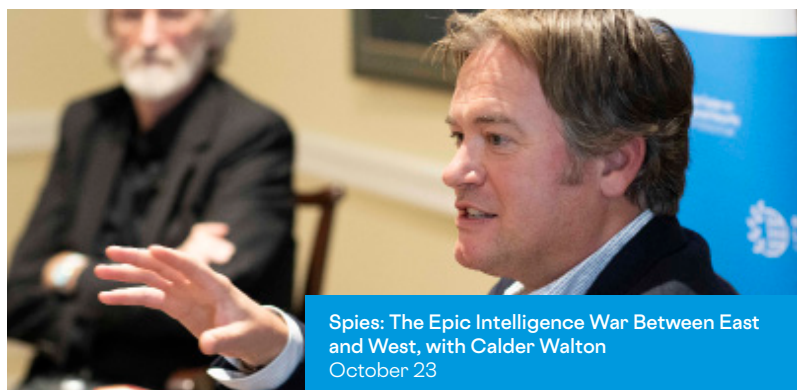
Spies: The Epic Intelligence War Between East and West, with Calder Walton October 23